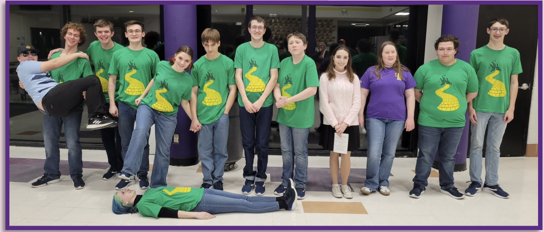
HS theater students took an opportunity to travel to Truman State University to take part in a reader's theatre clinic and workshop