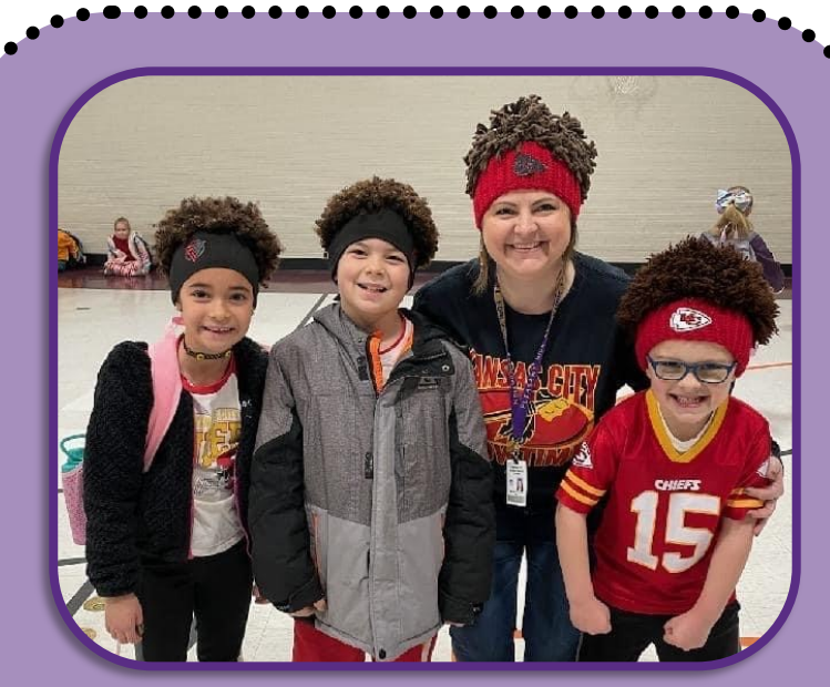
PS Students show their Chiefs spirit wear before the Superbowl (See page 12 for more)