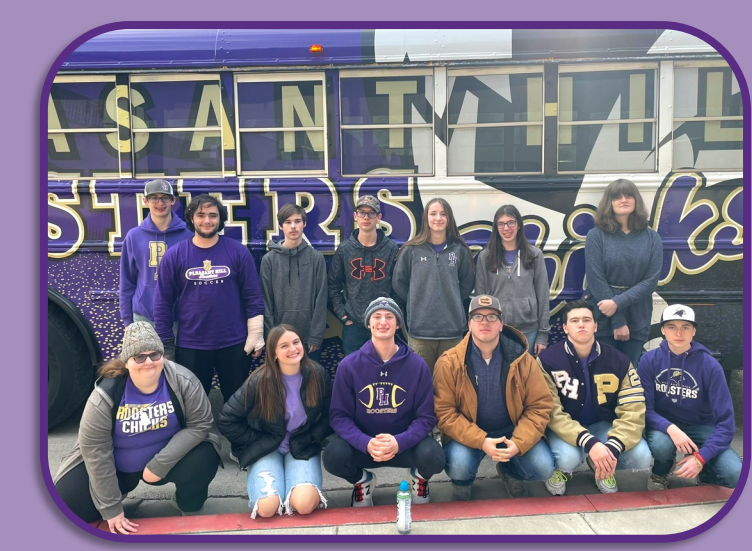
The PHHS Scholar Bowl Team finished their regular season 11-1 and enters conference competitions as the #2 seed!