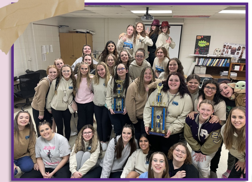
Hilltop Singers finished 6th and Hillside Singers finished 2nd in the Harrisonville Show Choir competition!