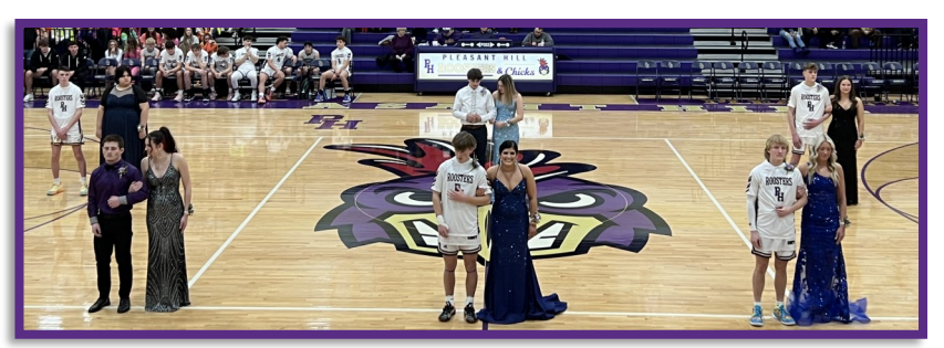
The Winter Court